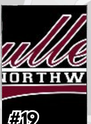
DULCIE CLEELAND 2028